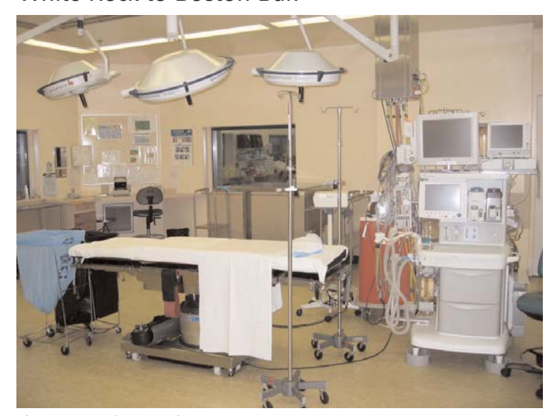
Open Heart Surgery Operating theater

The current hospital is located on East Columbia Street in New Westminster, overlooking the Fraser River. The Royal Columbian Hospital has 402 acute beds and a medical staff of 385 physicians including 8 full time cardiologists. Fourteen cardiologists have admitting privileges. RCH provides tertiary/ trauma care to the Fraser Health Authority which extends from Burnaby to White Rock to Boston Bar.